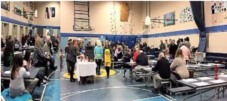
A captive audience. Enjoying the concert!