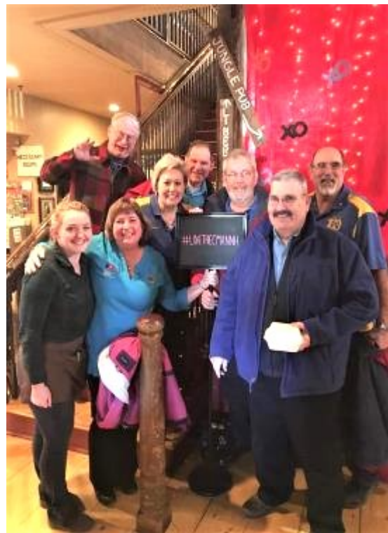
A stop by the Common Man after training!