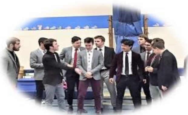
Tufts Beezlebubs performing!