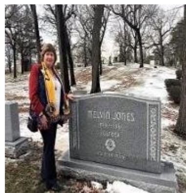
FIELD TRIP to LCI Headquarters and visit to the grave of MELVIN JONES