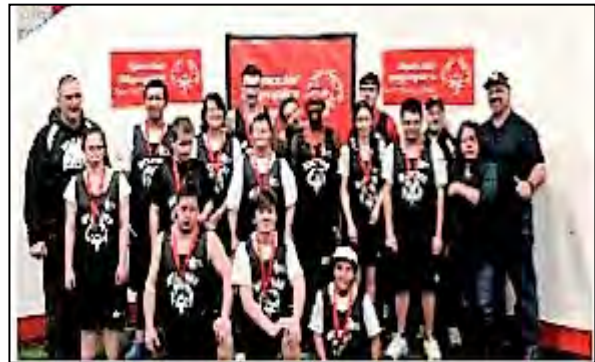
Milford Special Olympics