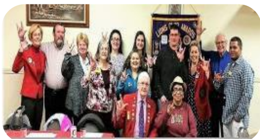
MANCHESTER - 6/15/1923 95 years in service!