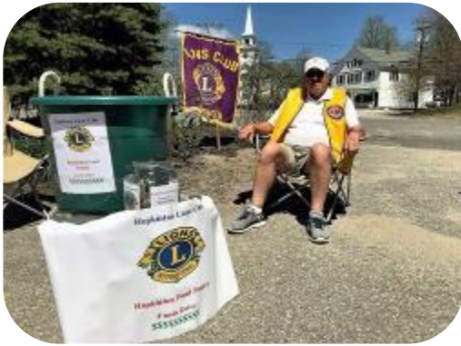
Hopkinton Lions Food Pantry Fundraiser