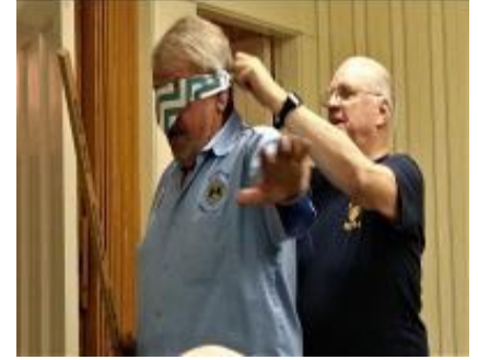
Above photos: Zone clubs and DG visit during Uno de Mayo meeting!