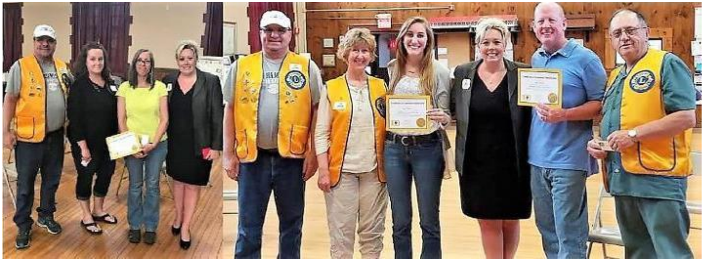
Winchester Centennial Lions Newest Members and Sponsors 05/14/2018