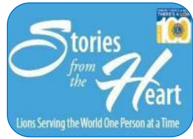
"Stories from the Heart"

Lions Serving the World One Person at a Time