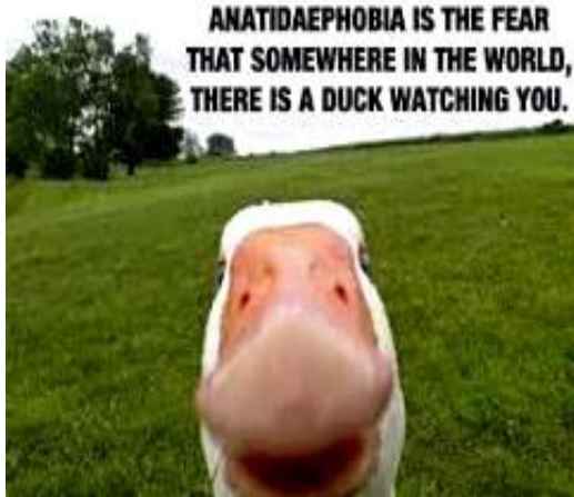
Keene Lions annual "Great Ashuelot River Duck Race" June 16, 2018 10 am