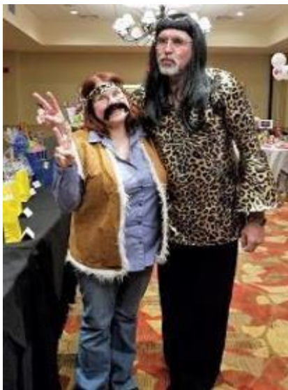
Sonny & Cher! Awesome!