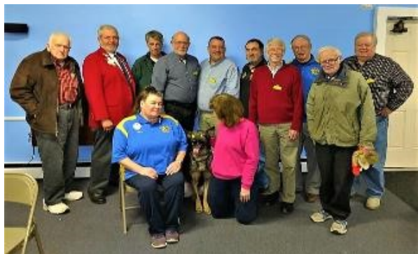
GOFFSTOWN LIONS visitation.