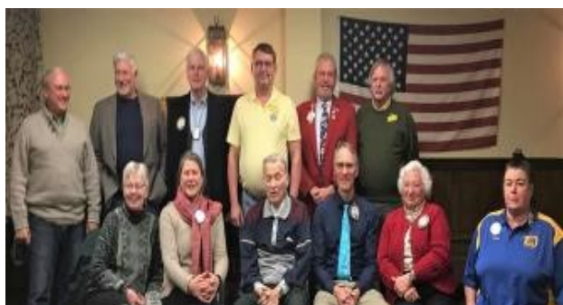
HANOVER LIONS visitation