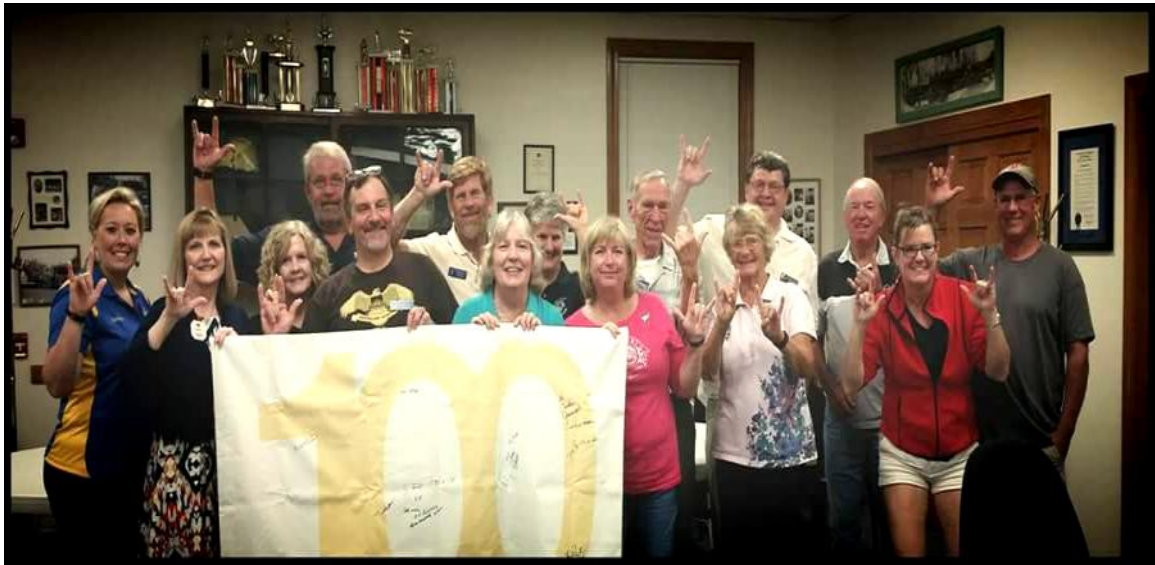
SEPTEMBER 22ND - BROOKLINE LIONS