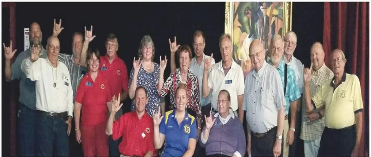
SEPTEMBER 1ST - CANAAN LIONS