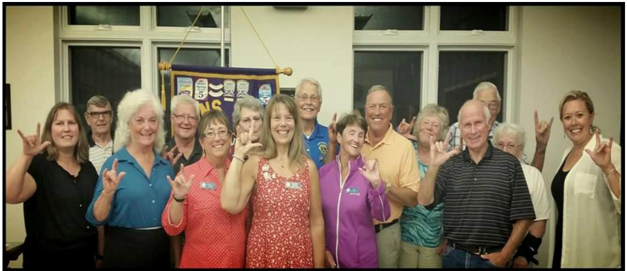
SEPTEMBER 6TH - CHESTERFIELD LIONS