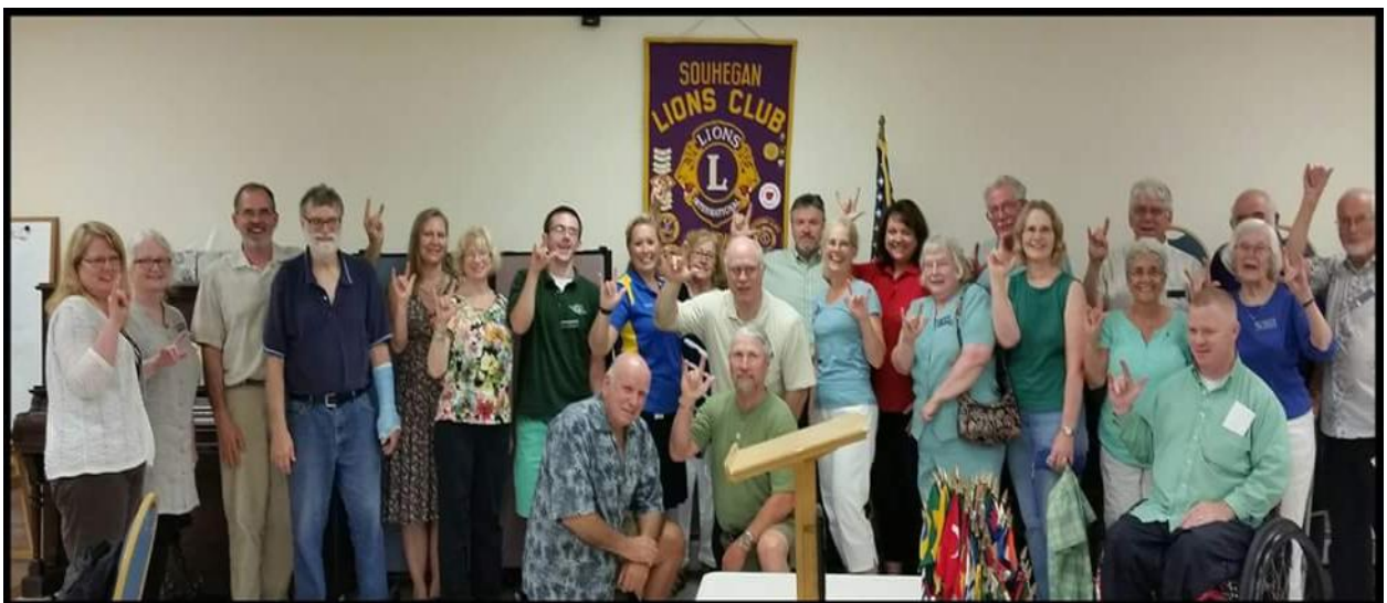
SEPTEMBER 8TH - SOUHEGAN LIONS