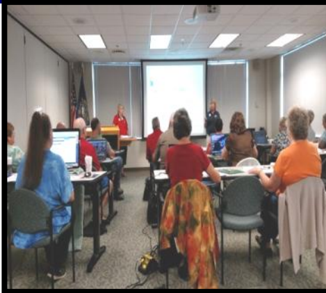
Multiple District 44 Secretary Training 2016