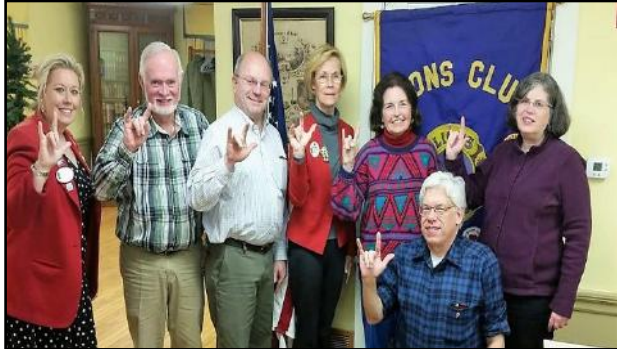
NEW LONDON - 3/18/1955 62 years in service!