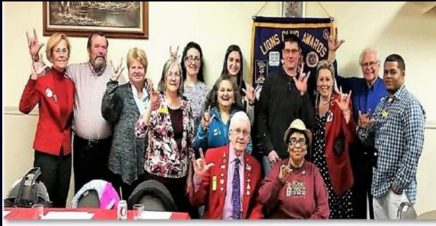
MANCHESTER - 6/15/1923 94 years in service!