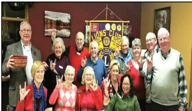
BEDFORD - 11/08/1965 52 years in service!