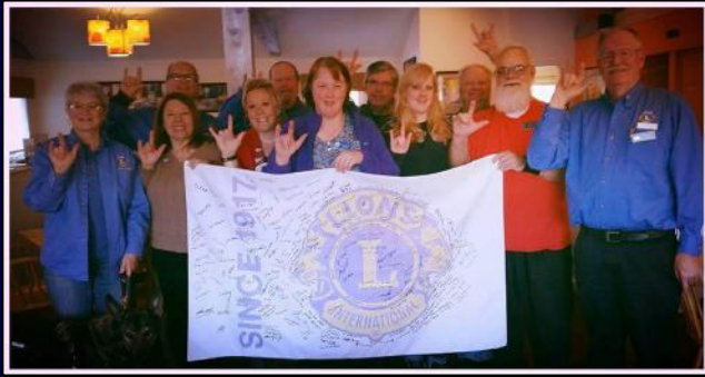
MONADNOCK - 3/28/1960 57 years in service!