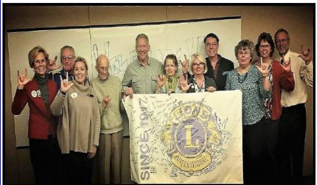
CLAREMONT - 6/6/2009 8 years in service!

BROOKLINE - was busy this month. Eric was elected to be District Governor next year during the Spring Convention. Flags are being put up along the main street in town. The annual plant sale went very well in our new location (due to road construction!). Two puppies and their puppy raisers came to speak to the club about what goes into raising a Guide Dog puppy. Very interesting and a lot of hard work!