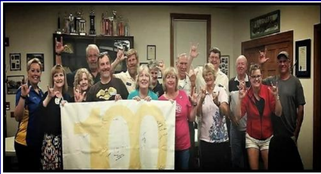
BROOKLINE - 6/10/2002 15 years in service!