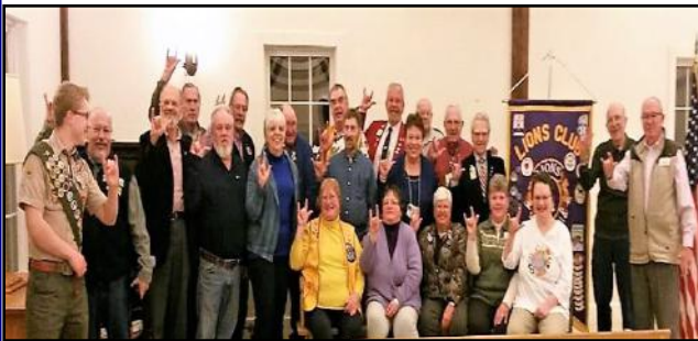
HOPKINTON - 6/01/1978 39 years in service!

HILLSBORO - $100 donated to Hillsboro Area Food Pantry. 82 pairs of eyeglasses collected for recycling, also 4 hearing aids. Provided eye exam for $40 for one person. $500 donated to LSHF for one Progressive Granite State Fellowship. $350 donated to Hillsboro Boy Scouts for Camperships. $50 donated to NH Brain Injury "Walk By The Sea". Annual Installation of Officers and Awards night is 27 June.