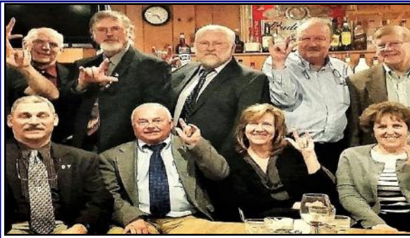
COHASE-WOODSVILLE - 9/30/1937 80 years in service!