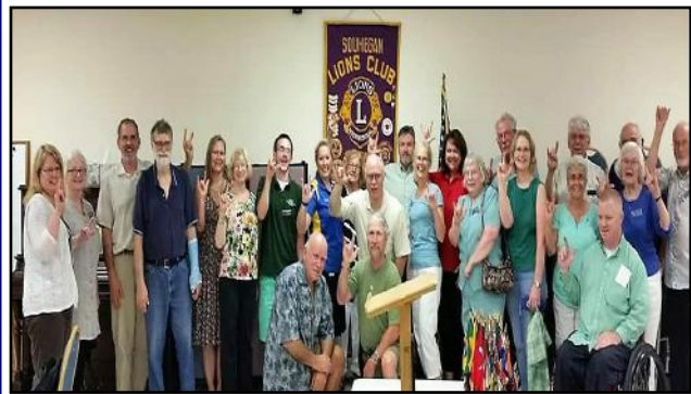
SOUHEGAN - 5/20/1965 52 years in service!