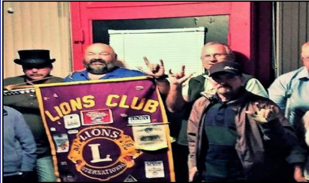
HINSDALE - 2/25/1969 48 years in service!