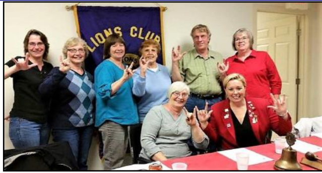
GAP MTN - 4/01/1964 53 years in service!