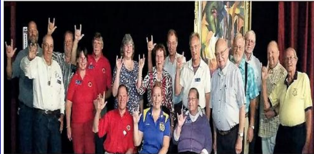
CANAAN - 8/28/1952 65 years in service!