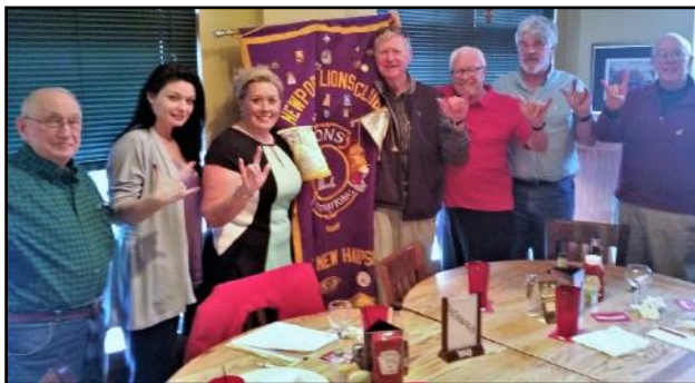
NEWPORT - 6/26/1930 87 years in service!