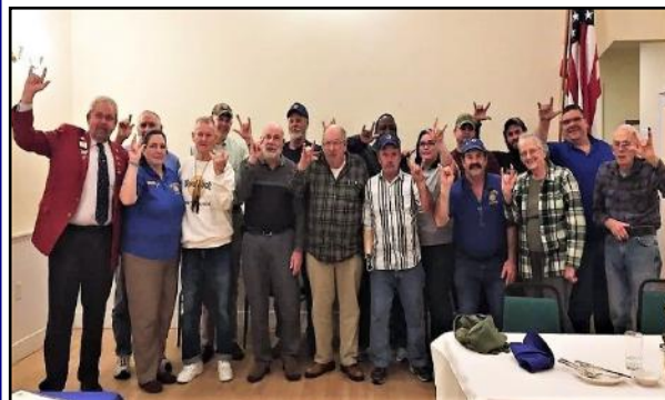
ENFIELD MASCOMA - 8/4/1954 63 years in service!