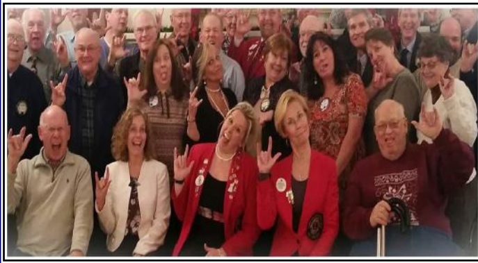
KEENE - 8/23/1937 80 years in service!

KEENE - our Junior lions continue to serve food at the Keene Community Kitchen each Friday night with a Lions Member mentor. In full swing selling Ashuelot River Duck race tickets for the race which will take place in June. This is one of our two major fundraisers, the other being our Broadway Show in February.