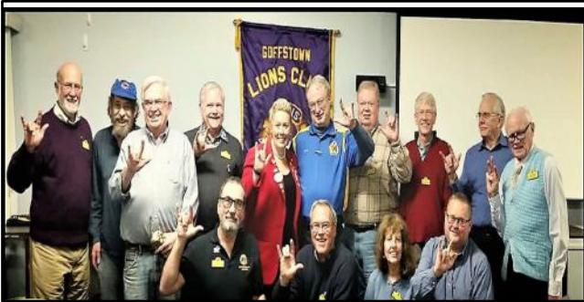
GOFFSTOWN - 9/12/1951 66 years in service!