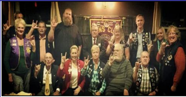
LITTLETON - 5/25/1938 79 years in service!