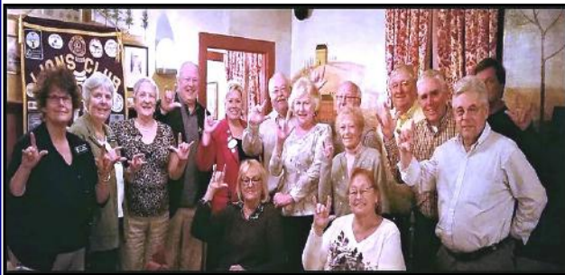
MERRIMACK - 4/20/1990 47 years in service!