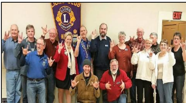
WILTON - 8/28/1951 66 years in service!

WESTMORELAND – provided Lions Luncheons for 11 Westmoreland School students at the May gathering for students performing an outstanding act of courtesy, kindness, citizenship, or scholastic improvement. Set up tables and chairs, as well as assembling and delivering a food basket door prize for the May “Friendly Meals” dinner at the Westmoreland Town Hall. Six of our members and thirteen others collected 63 bags of trash at our April 22 nd road side cleanup. Seven of the volunteers were youths. We provided reflective vests, coffee, donuts, and bottled water to the participants