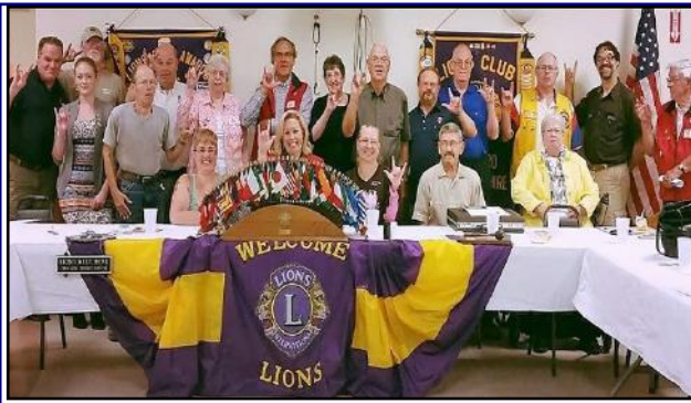
HILLSBORO - 3/31/1953 64 years in service!