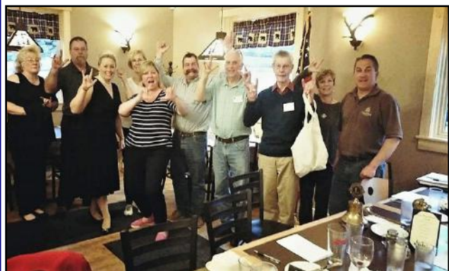
SUNAPEE - 4/24/1958 59 years in service!