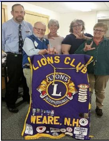
WEARE 2/22/1990 27 years In service!