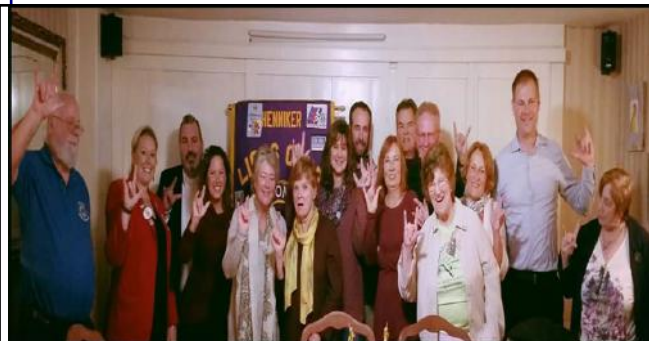
HENNIKER - 3/5/1984 33 years in service!