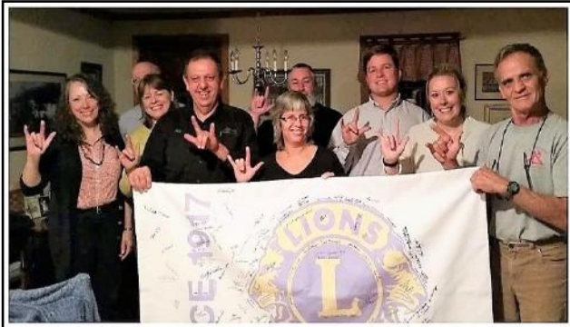
WESTMORELAND— 1/14/1980 37 years in service!