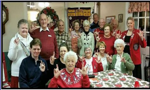
PINARDVILLE - 1/27/1953 64 years in service!