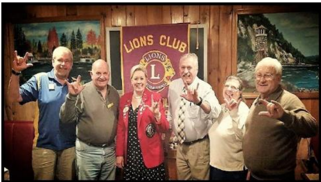
BRISTOL - 10/31/1951 66 years in service!