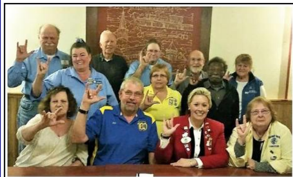
FRANKLIN - 4/22/2010 7 YEARS IN SERVICE!