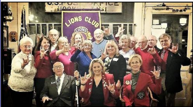
HOOKSETT - 5/01/1964 53 years in service!