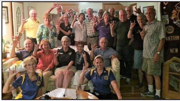
ANDOVER - 11/23/1954 63 years in service!