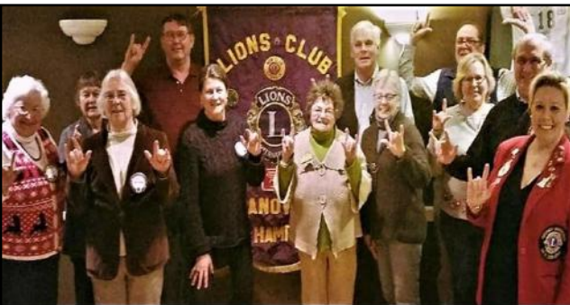
HANOVER - 9/29/1937 80 years in service!