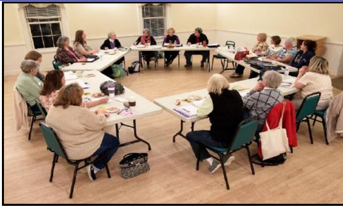
ENFIELD MASCOMA LIONESS - 5/26/1982 35 years in service!