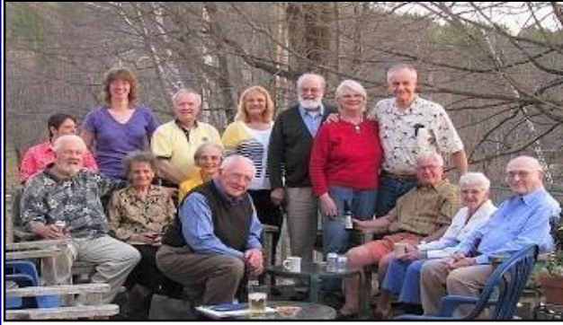
LAFAYETTE - 11/26/1979 38 years in service!