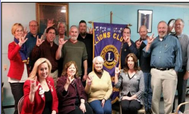
LISBON - 11/01/1938 79 years in service!

LANCASTER - a recent club meeting was held at The Lancaster Historical Society where our members also toured the Wilder-Holton Museum. Through OKS we visited a school in Berlin and screened the eyes of 216 students. Covering a mile along route 3 in Lancaster our members braved the inclement weather picking up countless bags of trash for Road-Side Pickup. Donations were made to NH Sight and Hearing and to The Lancaster Renaissance whose volunteers organize many community events in town. Annually our club holds a cookout for our local Boy Scout troop. This year we served 120 Scouts and their family members.