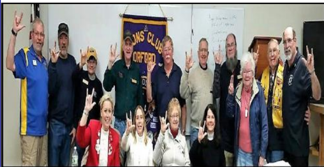
ORFORD - 4/28/1986 31 years in service!