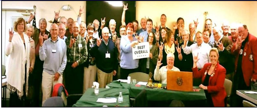
AMHERST - 5/30/1972 45 years in service