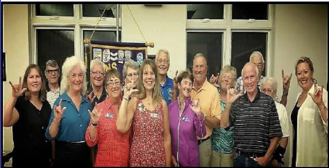
CHESTERFIELD - 5/17/1985 32 years in service!