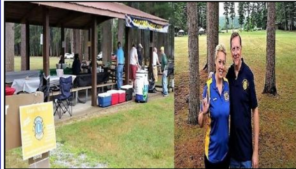
CONCORD - 1/28/1948 69 years in service!