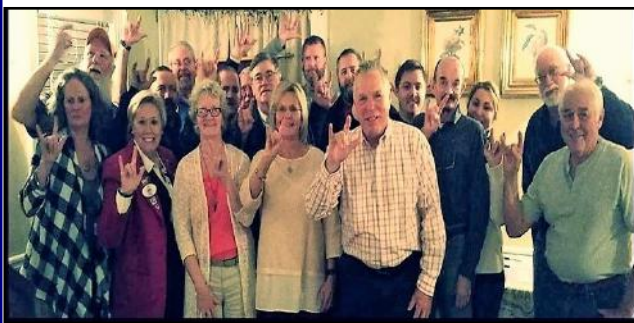
WHITEFIELD - 2/22/1971 46 years in service!