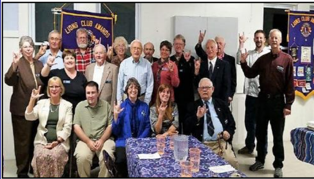
PETERBOROUGH - 2/25/1952 65 years in service!