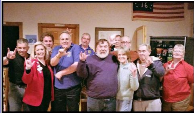
LANCASTER - 1/4/1983 34 years in service!

LANCASTER - a recent club meeting was held at The Lancaster Historical Society where our members also toured the Wilder-Holton Museum. Through OKS we visited a school in Berlin and screened the eyes of 216 students. Covering a mile along route 3 in Lancaster our members braved the inclement weather picking up countless bags of trash for Road-Side Pickup. Donations were made to NH Sight and Hearing and to The Lancaster Renaissance whose volunteers organize many community events in town. Annually our club holds a cookout for our local Boy Scout troop. This year we served 120 Scouts and their family members.