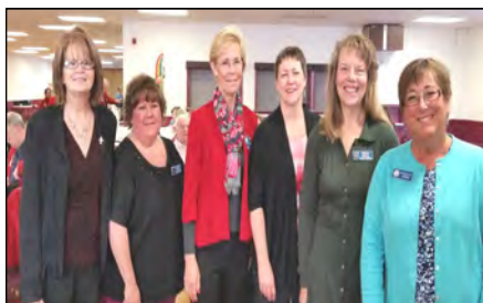
First time members joining members from the Chesterfield and Keene clubs at the 44N Cabinet Meeting.