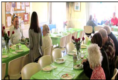
Setting up for the Senior Dinner