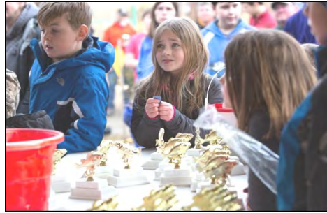
Young Ice Fishers at the trophy table