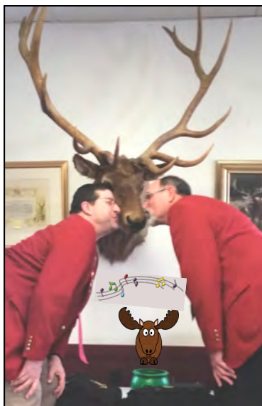
Brotherly DG LOVE?