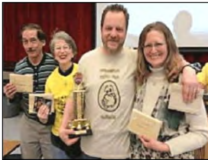
2nd Annual 2016 Scrambler Scrabble Tournament

MILFORD - held our 2nd annual Scrambler Scrabble tournament on March 20, 2016 wherein twelve teams of four players each played four games in a round robin format. Prizes were given for highest total score, highest individual game score, and highest individual word. Event was a fundraiser for the Reading Action Program activities co-sponsored by Wadleigh Memorial Library and the Milford High School library. Held monthly free spaghetti supper for 85 people who are mostly low-income seniors. Collected and processed 1,115 pairs of glasses since July. Photo on left depicts the winning team who were very good scrabble players and they also raised $500 for the event. The photo on the right shows some entrants representing the elementary schools.